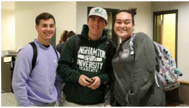
Students pose outside of the on-campus polling place on Election Day

Binghamton University students who live on campus can vote in the University Union. 710 students voted at the campus polling site in the 2022 General Election.